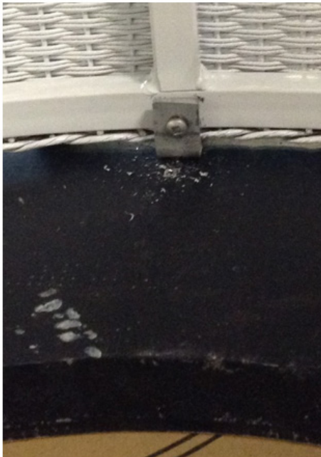
Example: bracket attached to inside of base.

B4. Attach bracket to top using 1/4" washers and 10-12 x 3/4" bolts.